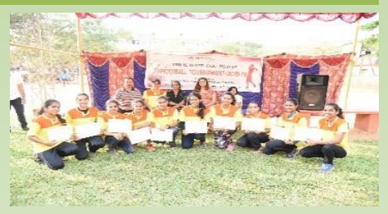
Intercollegiate female throw ball match was held on 10<sup>th</sup> March, 2019. MCON team bagged the runner up.