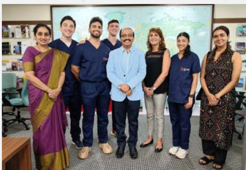
School of Dental Medicine, Boston University