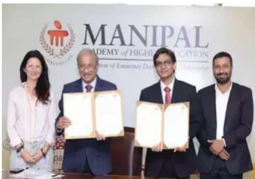
Celebration of Polish Science Day at MAHE

On 19 February 2021, the Office of International Affairs and Collaborations (OIAC) and the Department of Languages had organised the Polish Science Day celebration, and announced the inauguration of the National Agency of Academic Exchange